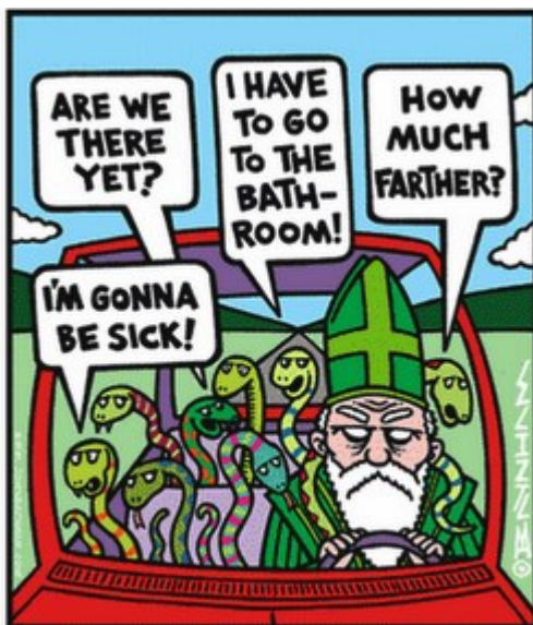
St. Patrick driving the snakes out of Ireland.